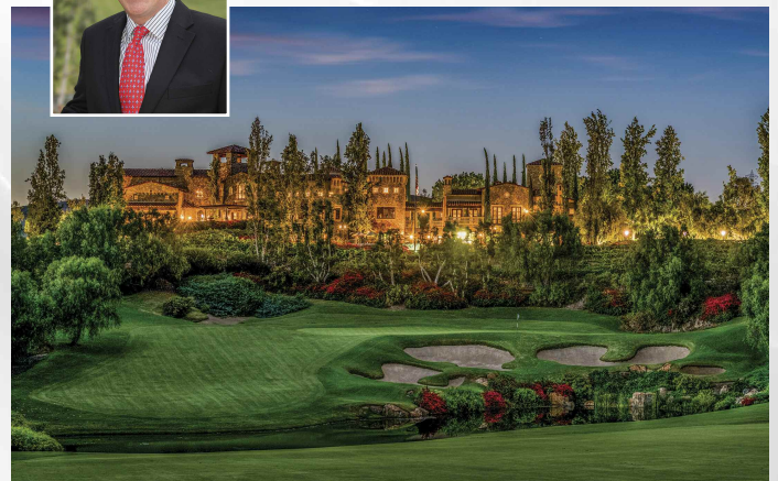
Bottom of page 24 ➤