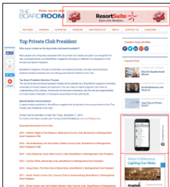
AD PLACEMENT AND SIZES ON BOARDROOMMAGAZINE.COM

New product link and listing at the bottom of all emails to clubs and GMs during the 2 month placement, 5 - 6 emails each issue. Email database of over 5000 emails.