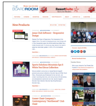
NEW PRODUCT PAGE