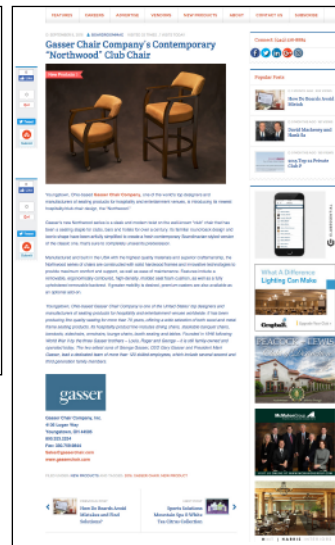
NEW PRODUCT LISTING